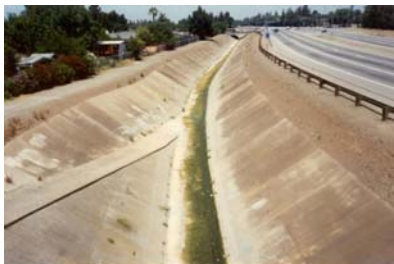
Example of an engineered channel

In the past, creek bank erosion was addressed by constructing engineered channels. But this created new problems for salmon and other migratory fish, and in some locations resulted in excessive sedimentation in the channels, requiring costly maintenance.