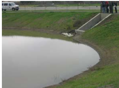
Detention pond provides stormwater treatment and hydromodification management.

and/or rainwater harvesting and use. More information is provided in a flyer on stormwater quality requirements (see “For More Information”). Integrating these low impact development (LID) designs into the site plan helps reduce changes in the site's hydrology. For projects in which it is feasible to meet stormwater treatment requirements with biotreatment, infiltration, evapotranspiration, and/or rainwater harvesting, it may be possible to design smaller flow duration control