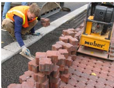
Ungrouted modular pavers are an example of a hydrologic source control.

Flow duration controls are designed so that the post-project stormwater discharge rates and durations match the pre-project rates and durations from 10 percent of the pre-project 2-year peak flow up to the pre-project 10-year flow. Projects that require flow duration controls typically also require water quality treatment controls (see flyer on stormwater quality requirements, referenced under “For More Information”). If feasible, combining flow duration and water quality treatment into one facility will reduce the land area needed for stormwater management.