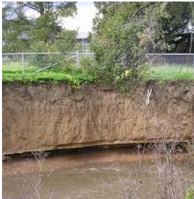
Example of creek bank erosion

When undeveloped land is covered with buildings and pavement, it causes more stormwater runoff to flow into creeks at faster rates. This may result in creek channel erosion, as well as flooding, habitat loss, and, in some cases, property damage. These development-induced changes to the natural hydrological processes and runoff characteristics are called hydromodification.